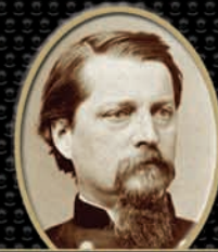
WINFIELD S. HANCOCK