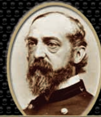
GEORGE G. MEADE