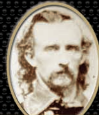
GEORGE A. CUSTER