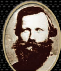
J.E.B. "JEB" STUART