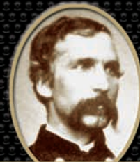
JOSHUA L. CHAMBERLAIN